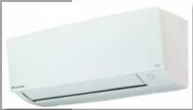
AIR CONDITIONING 3.5 kW Haier air conditioner with heating function