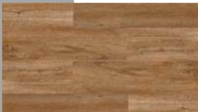
FLOOR vinyl panels, 10cm MDF baseboard