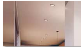
LIGHTING indoor and outdoor LED