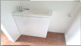
BATHROOM Hot water boiler 10l, cabinet with washbasin and built in tap, toilet bowl, non-rebated door, electric towel warmer/heater